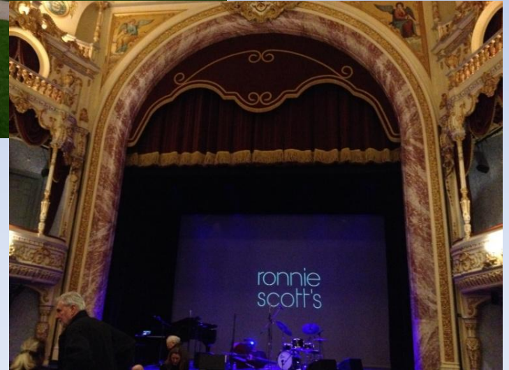
The Ronnie Scott's story Everyman