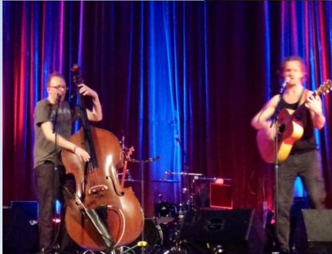
Folk Festival Cheltenham Town